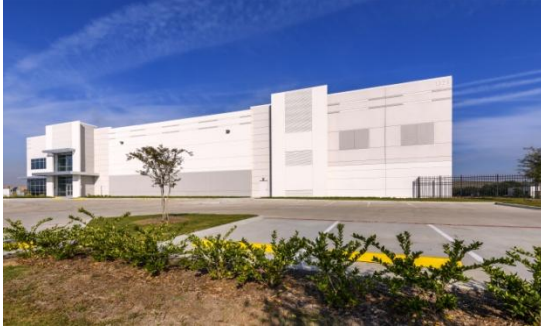
Carson Commerce 5, Pasadena, TX