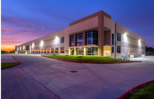
Colony Crossing II, Houston, TX