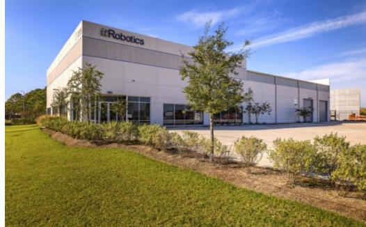
IT Robotics, Missouri City, TX