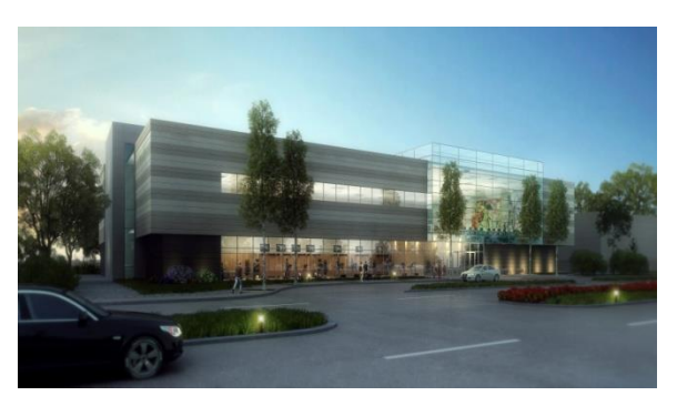
HCC Northline Campus, Houston, TX