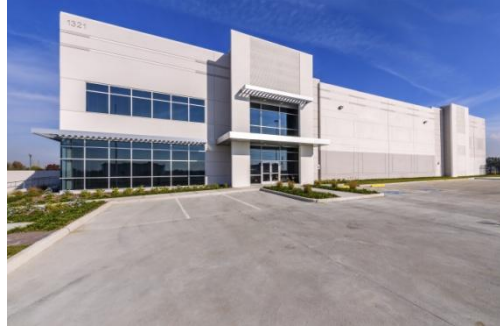
Carson Commerce 5, Pasadena, TX