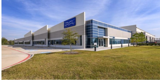
Alfa Laval, Houston, TX